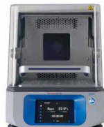
Solaris 2000 R Incubated and Refrigerated Shaker