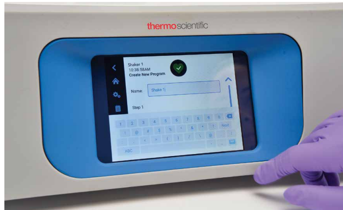
The large, bright user interface lets you easily monitor set points and status conditions from across the lab.

Solaris Orbital Shakers include a built-in orbital calculator that gives you the ability to convert protocols designed with different orbits and estimate the set speed needed to obtain similar results.